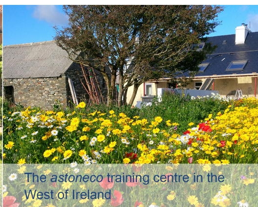
The astoneco training centre in the West of Ireland