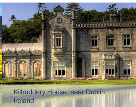
Killruddery House, near Dublin, Ireland

Team workshops can be organised in our retreats on Ireland's Wild Atlantic Way or Ancient East, in Transylvania, or at a venue preferred by you.