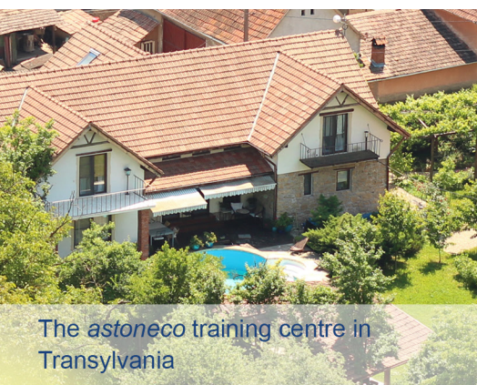
The astoneco training centre in Transylvania